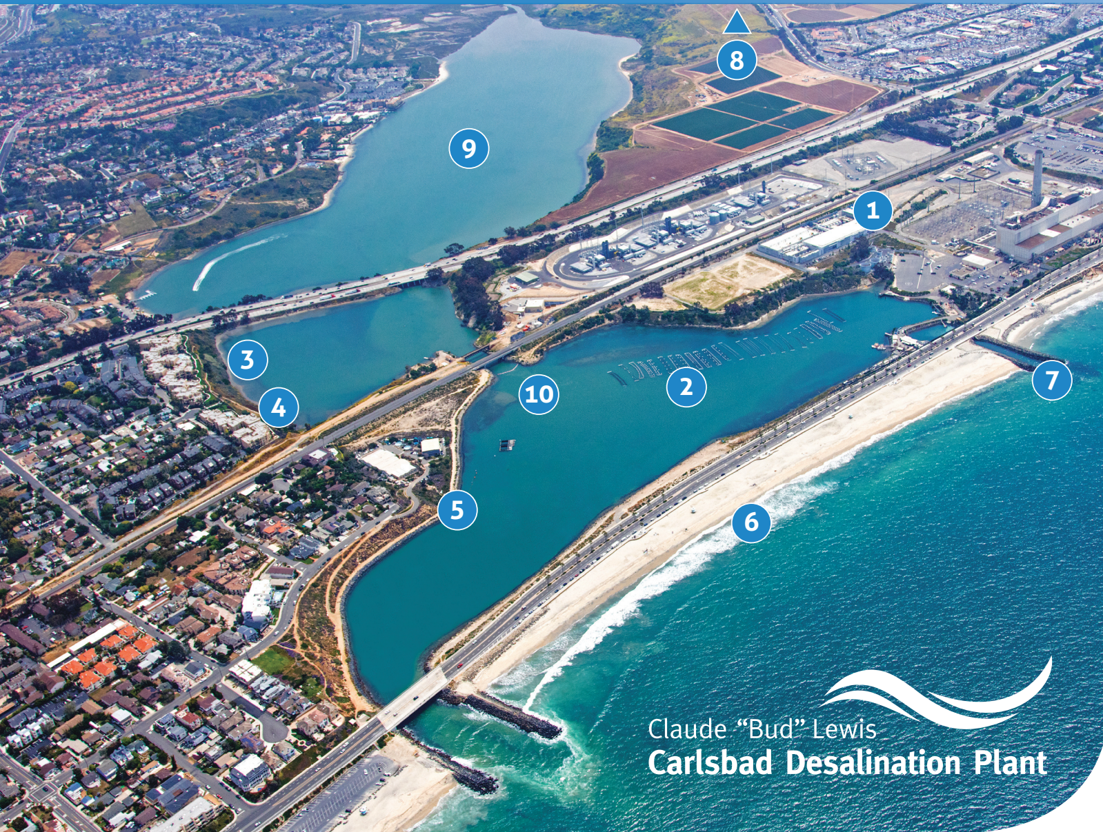
Claude “Bud” Lewis Carlsbad Desalination Plant